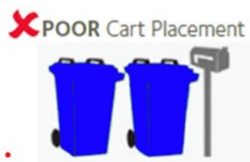
Objects and cart are too close together.