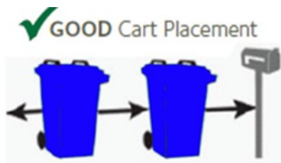
Keep space between objects and carts.