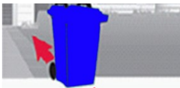
Place wheels of cart toward house.

Please place your cart out the night before your collection day or no later than 5:30am on your scheduled day. Place cart with wheels toward house and keep space between the cart and other objects.